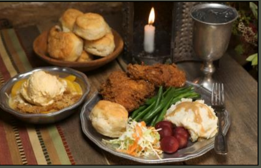
18th-century fare in rustic tavern setting

The Tavern's dining room features hearty Midday Fare in a rustic tavern setting. Attentive servers are pleased to take care of your every need.